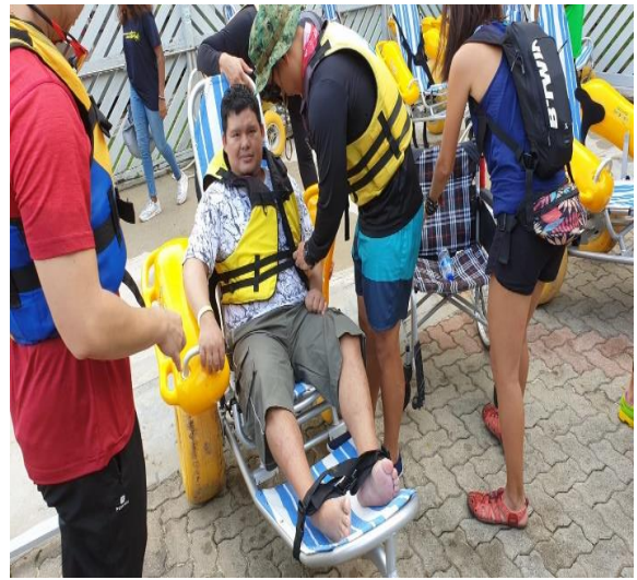
Get on an adventure! Exciting new experience of hopping onto a Mobi-Chair, a floating beach wheelchair