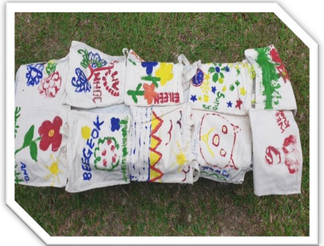
Tote bag painting by Residents