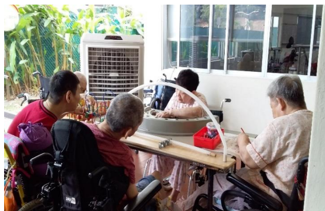
Coolers placed at Computer and Therapy Room