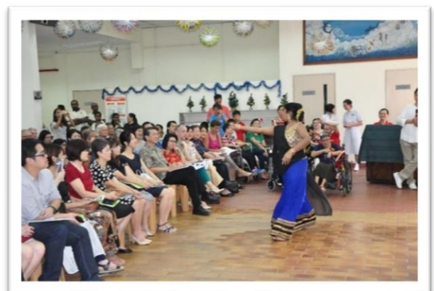
Bollywood dance by staff