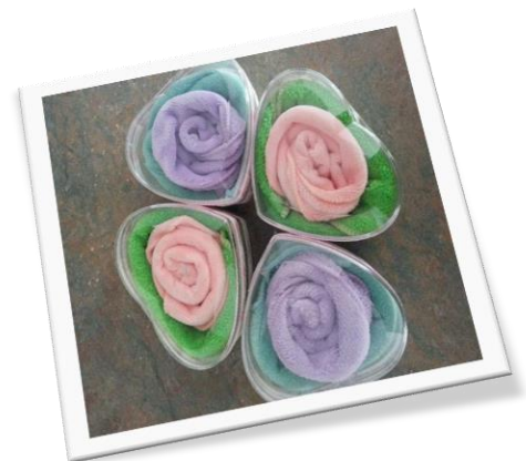
Making Towel roses in heart shape box